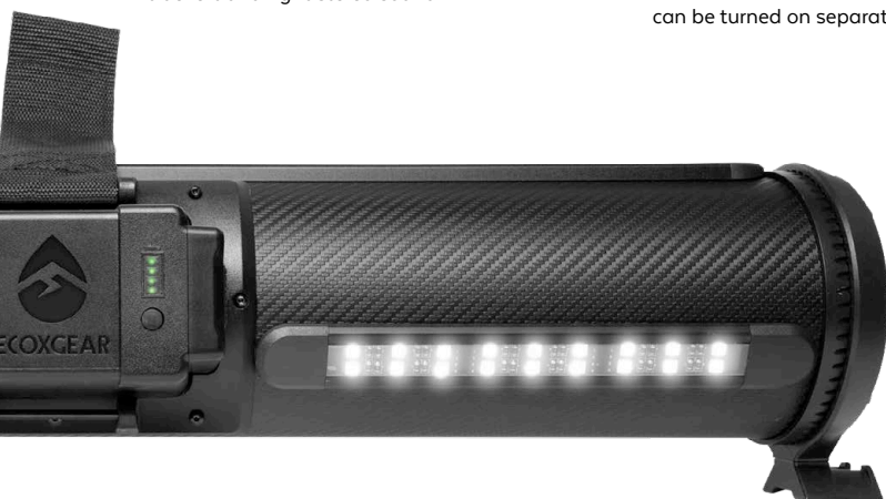
White Rear Lightbar