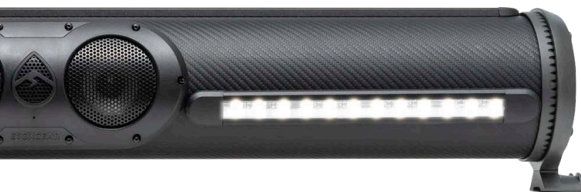
White Rear Lightbar