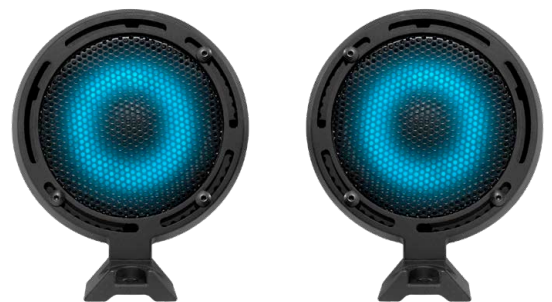
Dual Woofers & RGB Lights