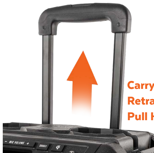
Carry Handles & Retractable Long Pull Handle