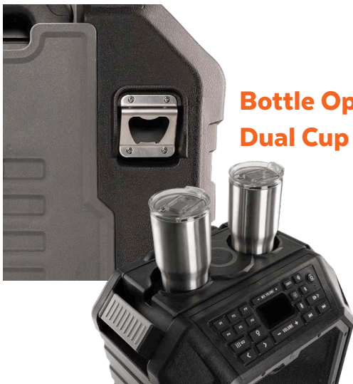
Bottle Opener & Dual Cup Holders