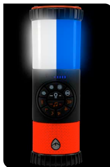
Two modes: Emergency - Flashes white and red light. Party - Flashes to the music or relaxing colour fade