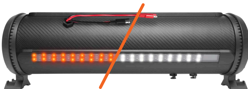
White & Red Lightbar