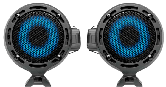
Dual Woofers & RGB Lights