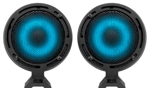
Dual Woofers & RGB Lights